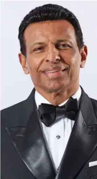
Sunny Varkey Chairman and Founder